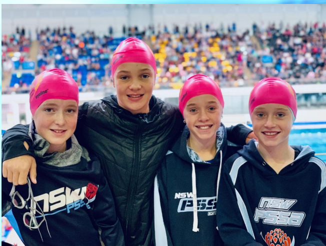
Senior Girls Relay Team