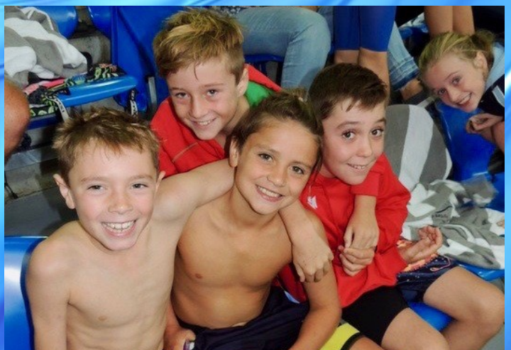
Junior Boys Relay Team