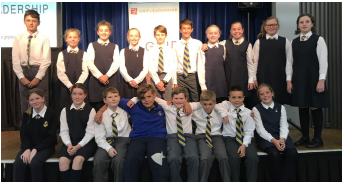
Forbes Public School Student Representative Council