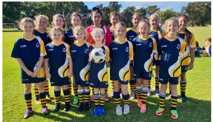
Forbes Public School Girls' Soccer Team