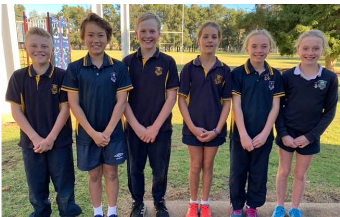
1500m Age Champions

First placegetters have qualified to represent Forbes Public in the 1500m event at the PSSA Lachlan Athletics Trials in Parkes on Friday, 9 August 2019.