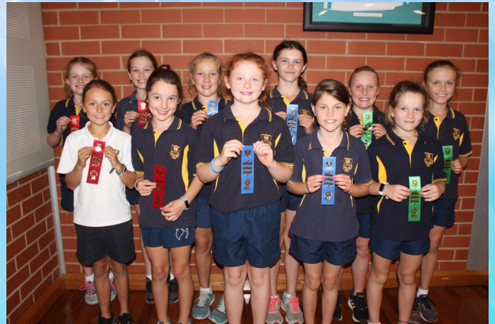
Junior Girls Relay