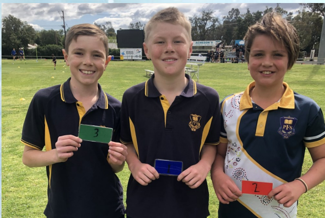
11 Years Boys