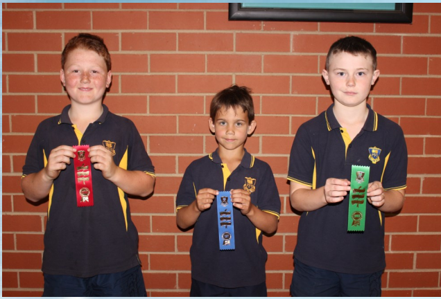
8/9 Years Boys