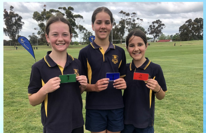
11 Years Girls