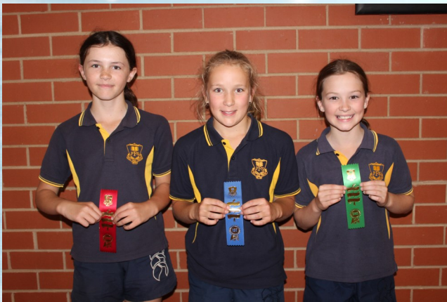
10 Years Girls