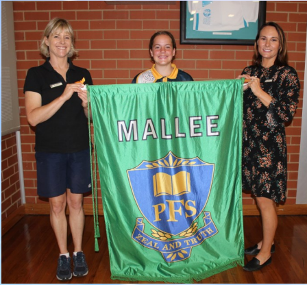
Winning House MALLEE!