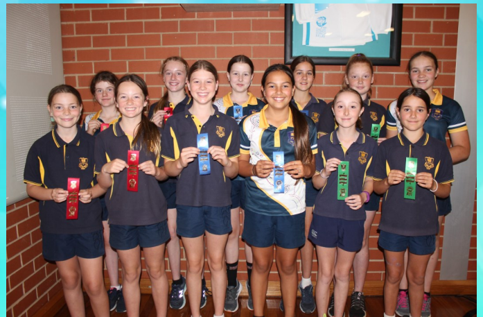
Senior Girls Relay