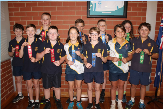
Junior Boys Relay