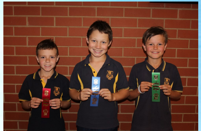
10 Years Boys