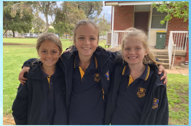
8/9 Years Girls