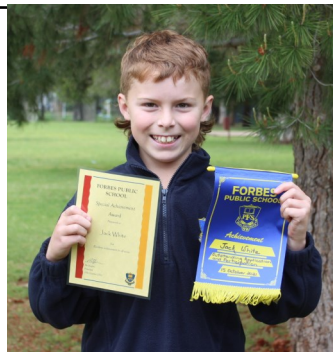
Jack White Blue & Gold Banner