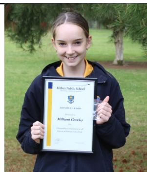
Millie Crowley Honour Award