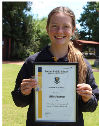
Ellie Pointon Honour Award