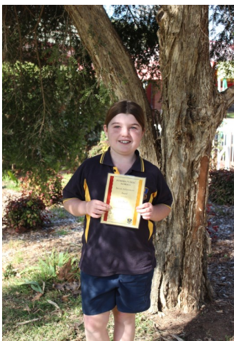
Isla Ball Special Achievement Award