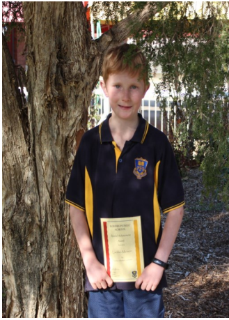
Lachlan Manson Special Achievement Award